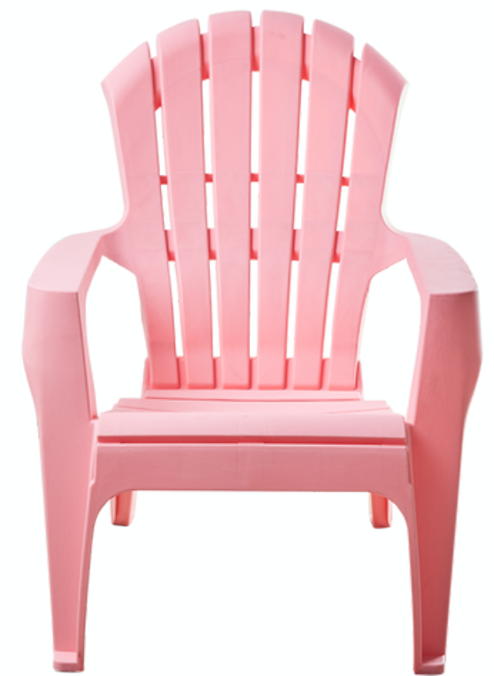
M188 COMFORT ADIRONDACK CHAIR FLAMINGO