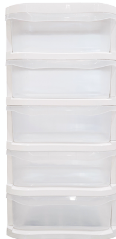
M301 HULK 5 TIER BIG DRAWER WHITE WITH TRANSPARENT