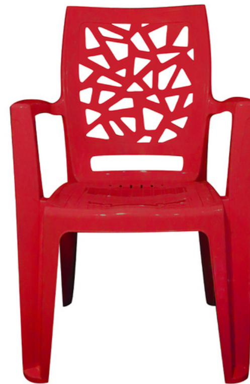
M208E MODERNA ARM CHAIR RED