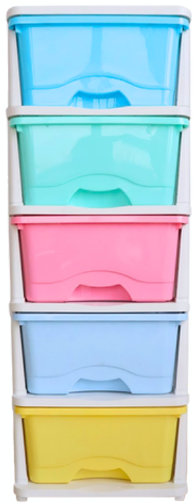
M300 SMART 5 TIER DRAWER WHITE WITH CANDY

These are the products we think are right for Cocomelon, and we'll have two new, different styles of drawers coming out next month.