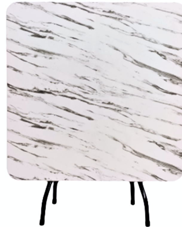
M200 3FT PLASTIC TABLE MARBLE WHITE