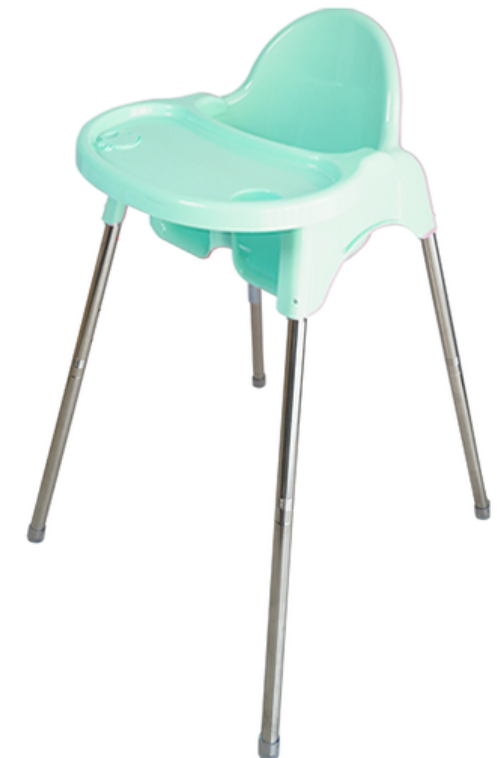
M888 ADJUSTABLE BABY CHAIR TIFFANY