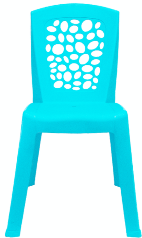
M178C MODERN DINING CHAIR BLUE

These are the products we think are right for Cocomelon, and we'll have two new, different styles of drawers coming out next month.