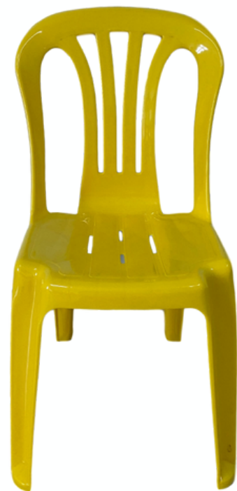
M198A MODERN DINING CHAIR YELLOW